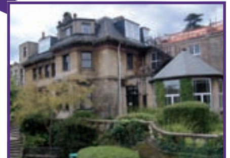
Upper Oldfield Park Campus