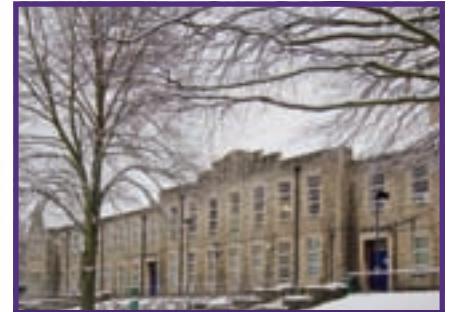
Brougham Hayes Campus