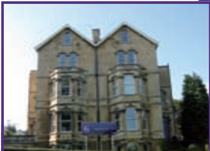
Sixth Form House